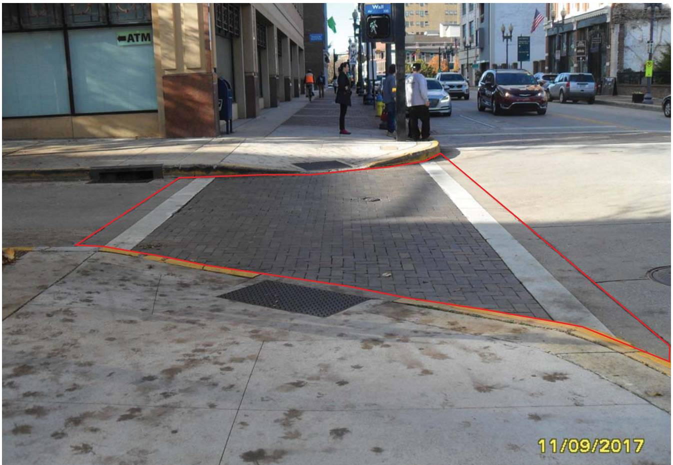
Gay Street at Wall Avenue