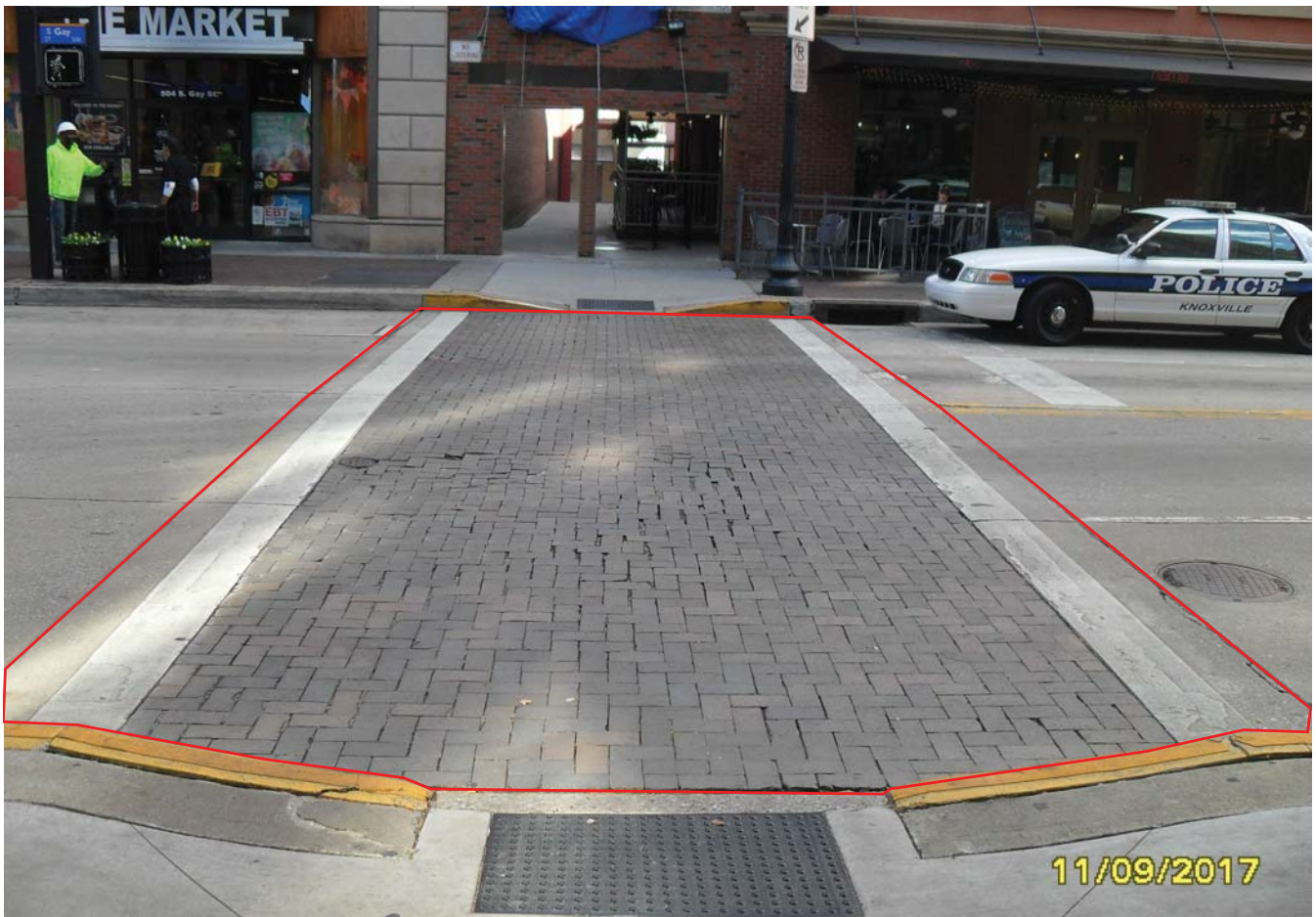
Gay Street at Union Avenue