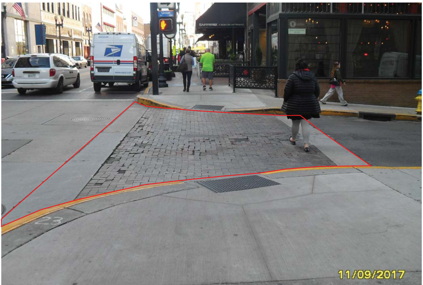
Gay Street at Union Avenue