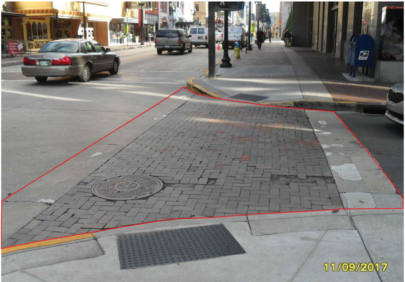
Gay Street at Union Avenue