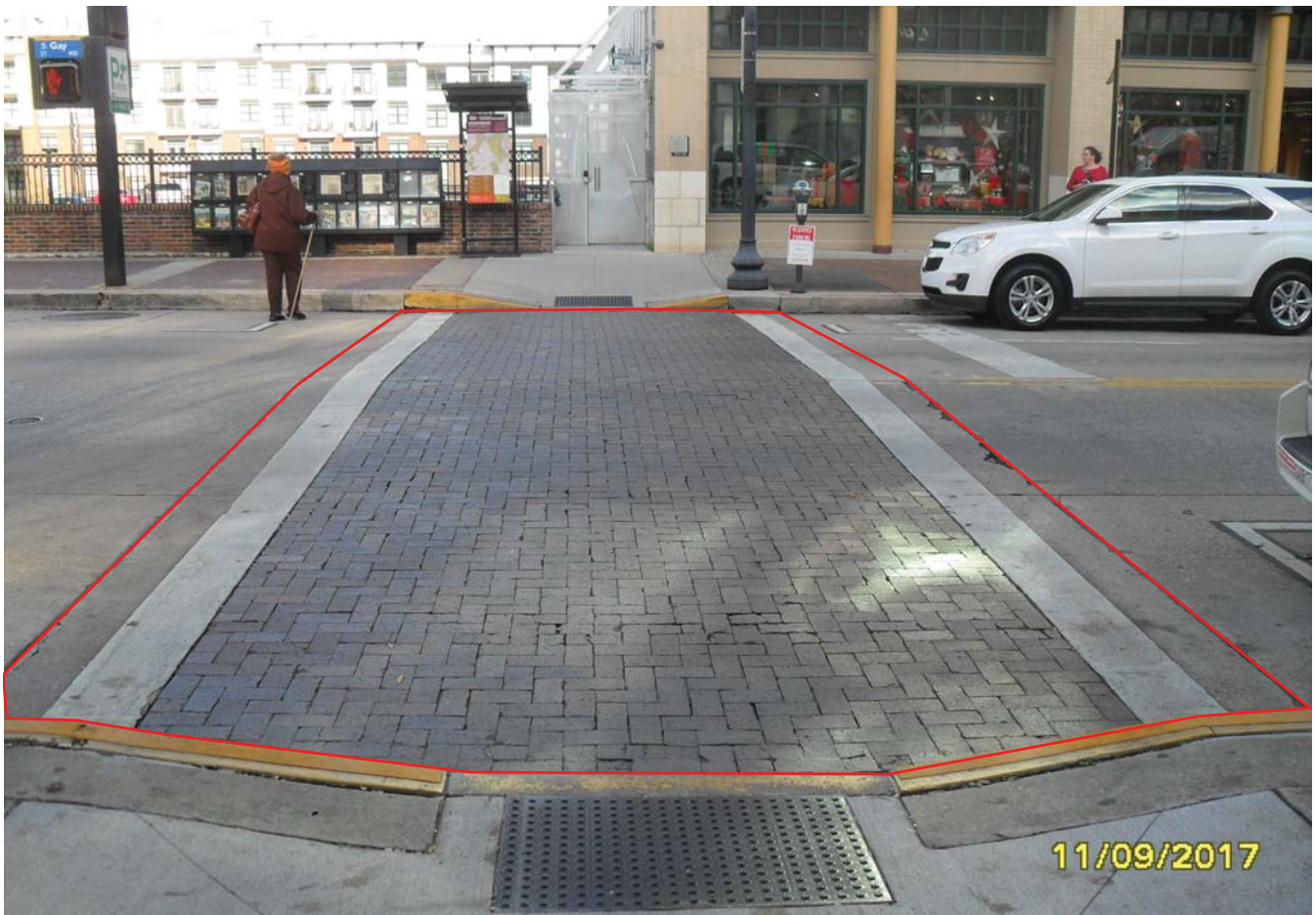
Gay Street at Wall Avenue