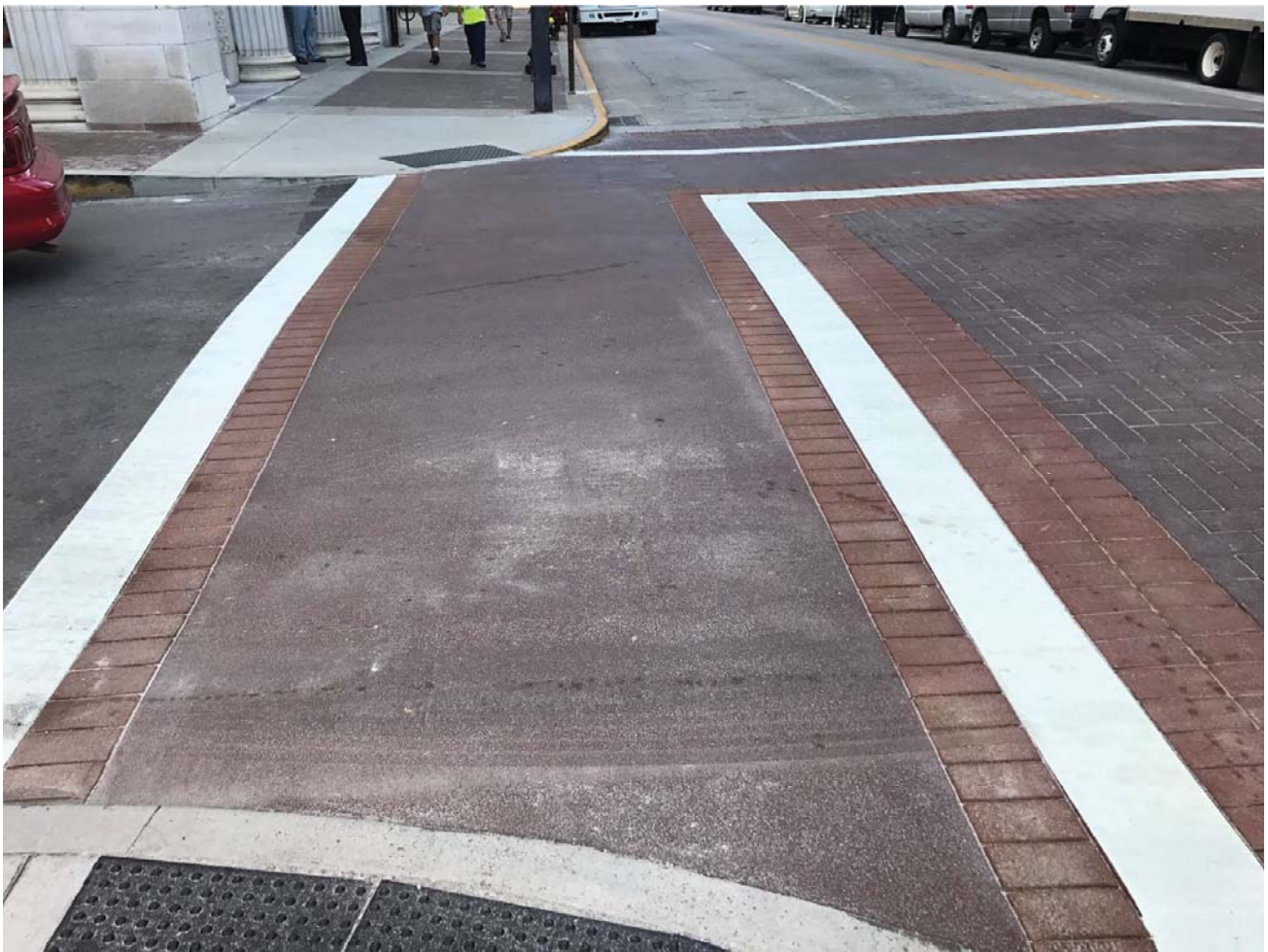
Existing Crosswalk Pattern at Gay Street and Clinch Avenue