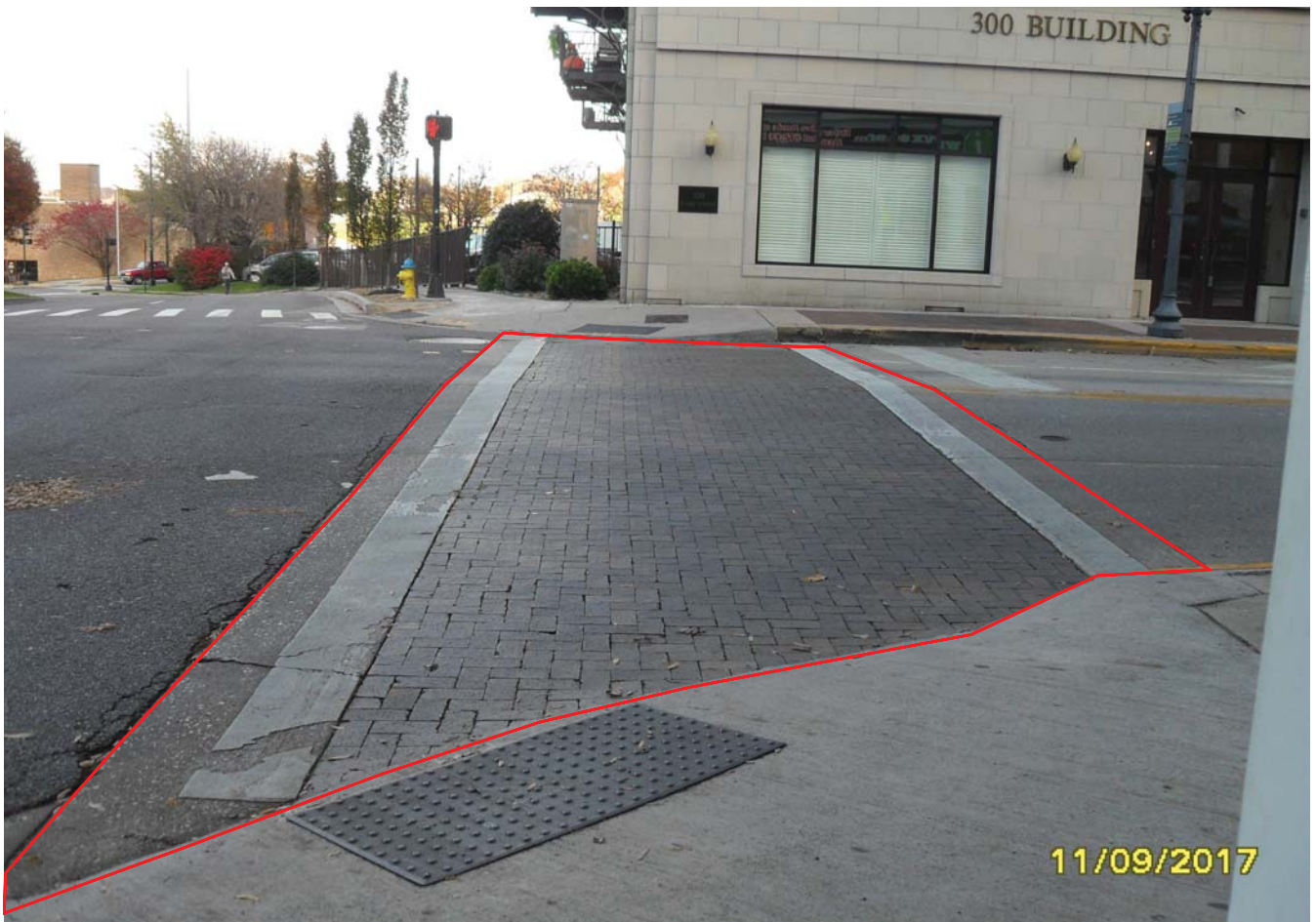
Gay Street at Summit Hill Drive