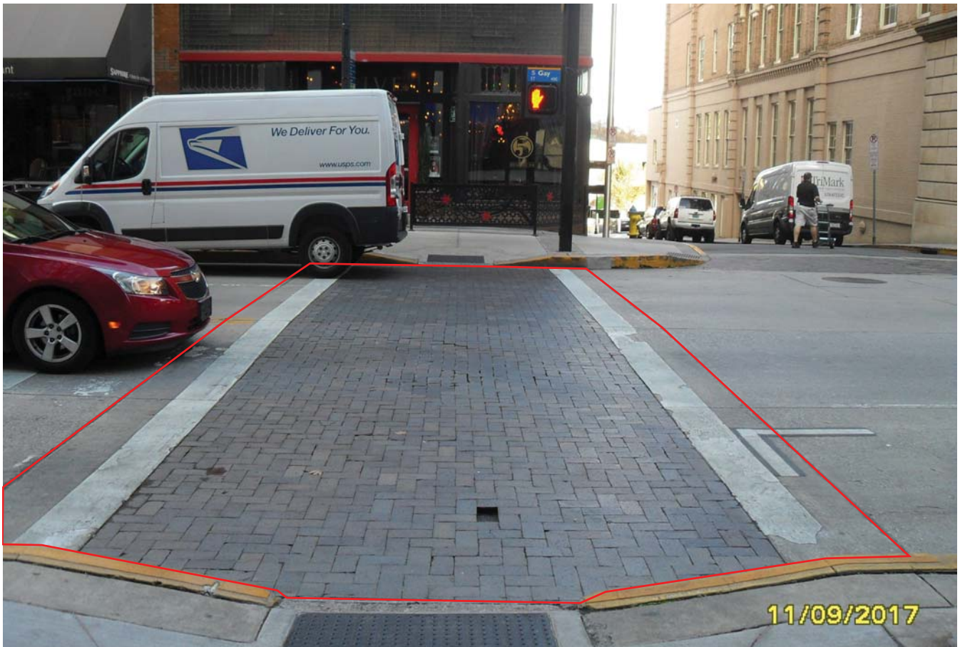
Gay Street at Union Avenue