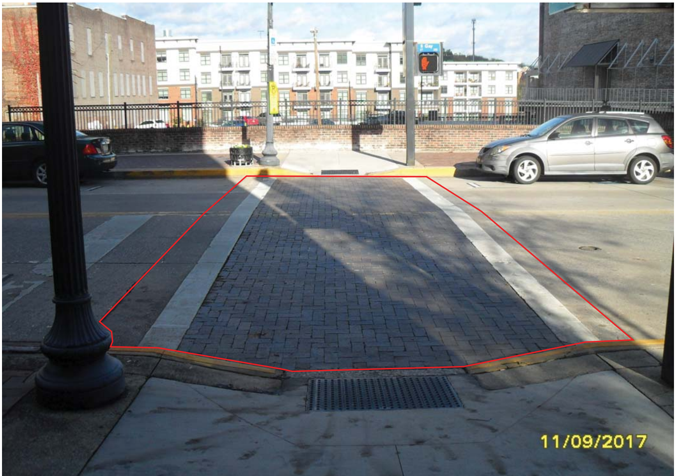
Gay Street at Wall Avenue