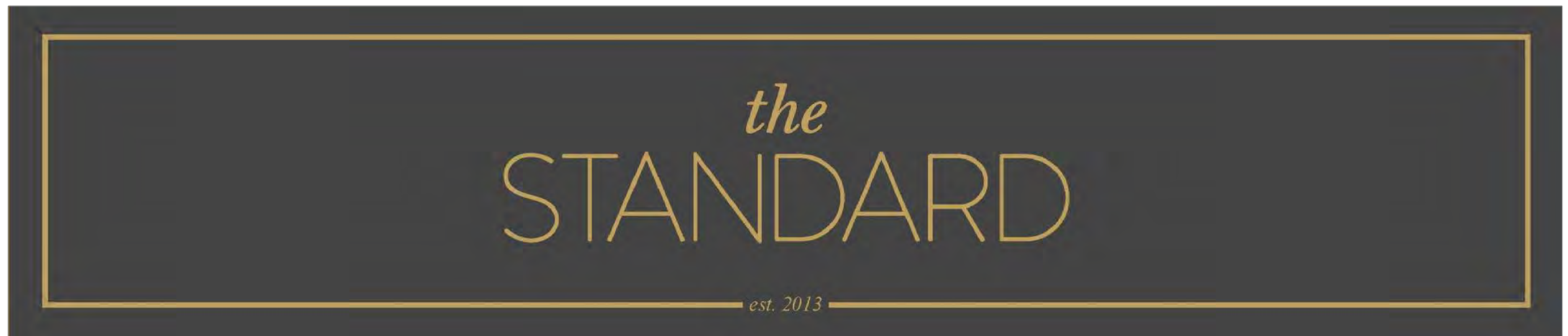
PROPOSED GRAPHIC FOR PAINTED ALUMINUM SIGN ON EXISTING ROOF SIGN