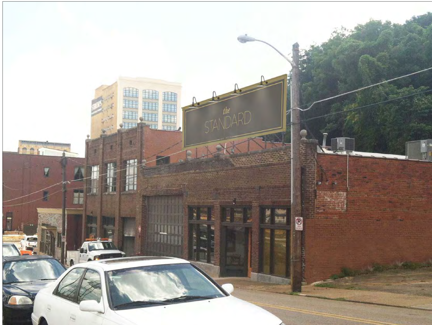
A1 RENDERING OF PROPOSED SIGN GRAPHIC