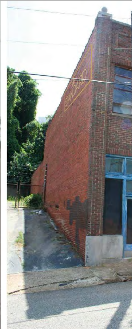
A1 RENDERING OF PROPOSED SIGN GRAPHIC