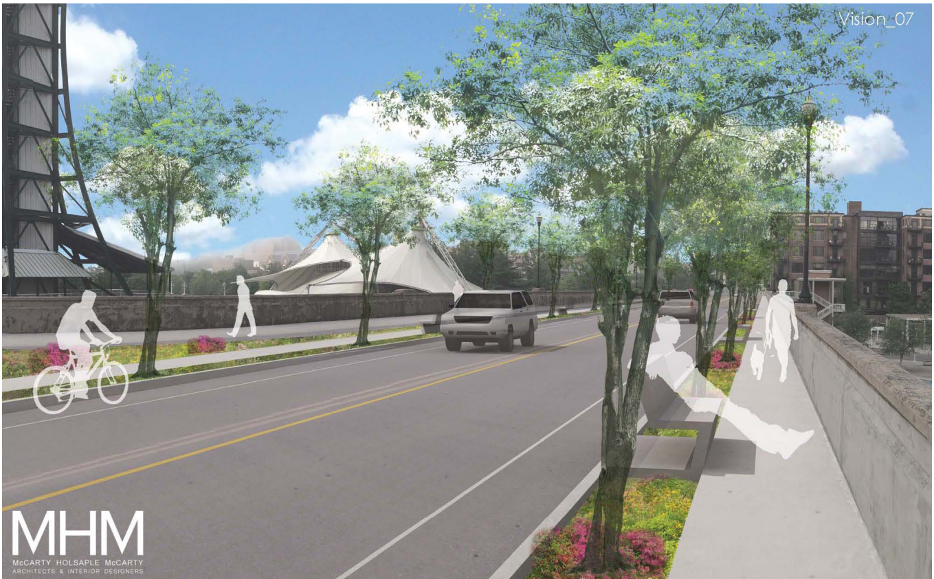
Proposed concept rendering from bridge, looking west

The following improvements are proposed for the existing bridge over World's Fair Park: widening of existing sidewalk with pavers, addition of precast concrete planters and benches, restriping of bridge lanes to include bike lanes and one car lane in each direction. New lane striping transitions back to existing configuration at east and west intersections.