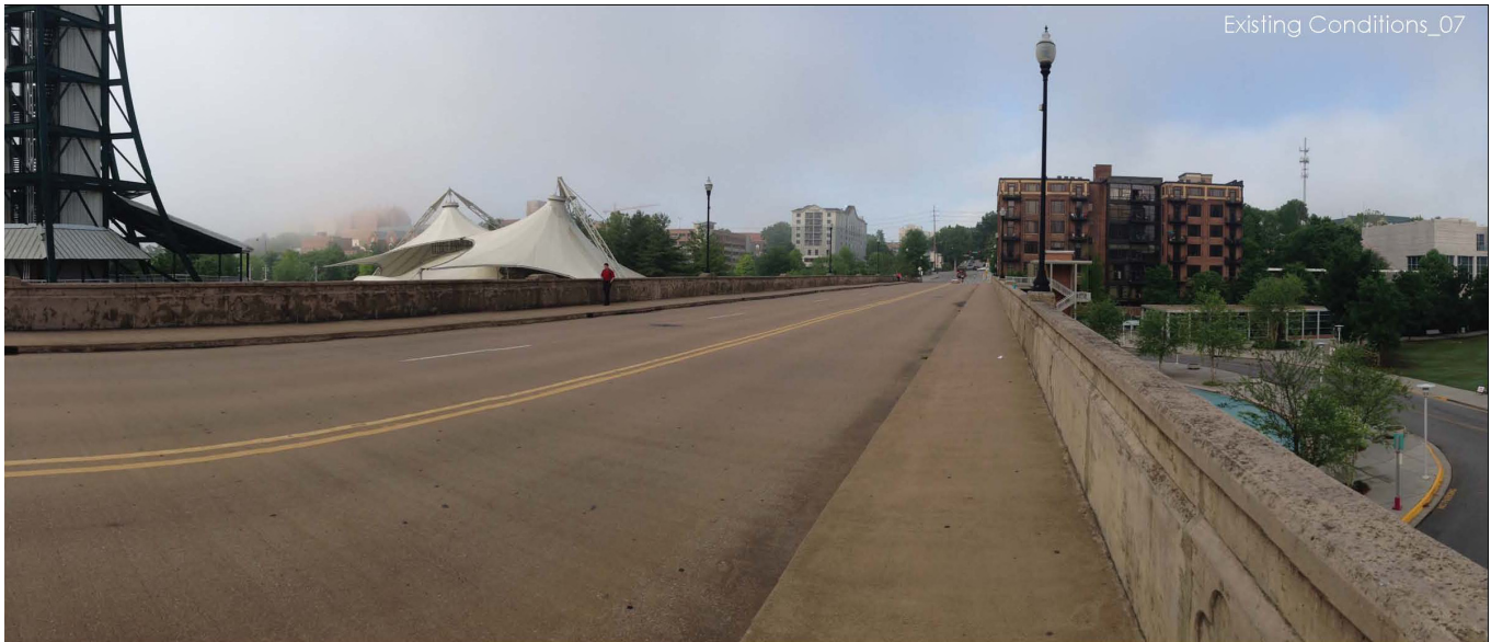
Existing view from bridge, looking west