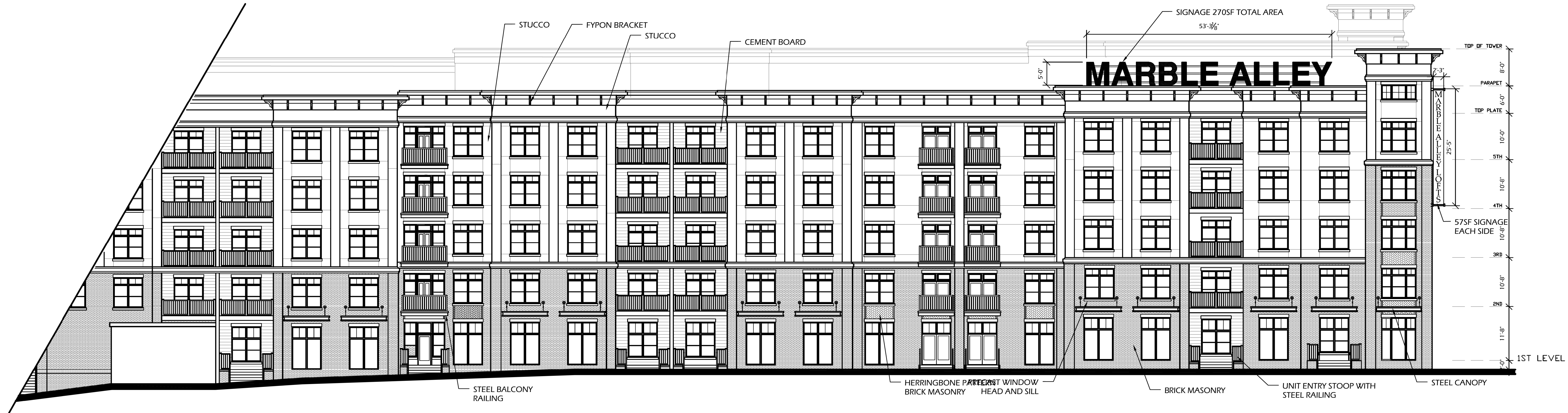
S. CENTRAL STREET ELEVATION SCALE 3/32"=1'-0" NORTH PORTION