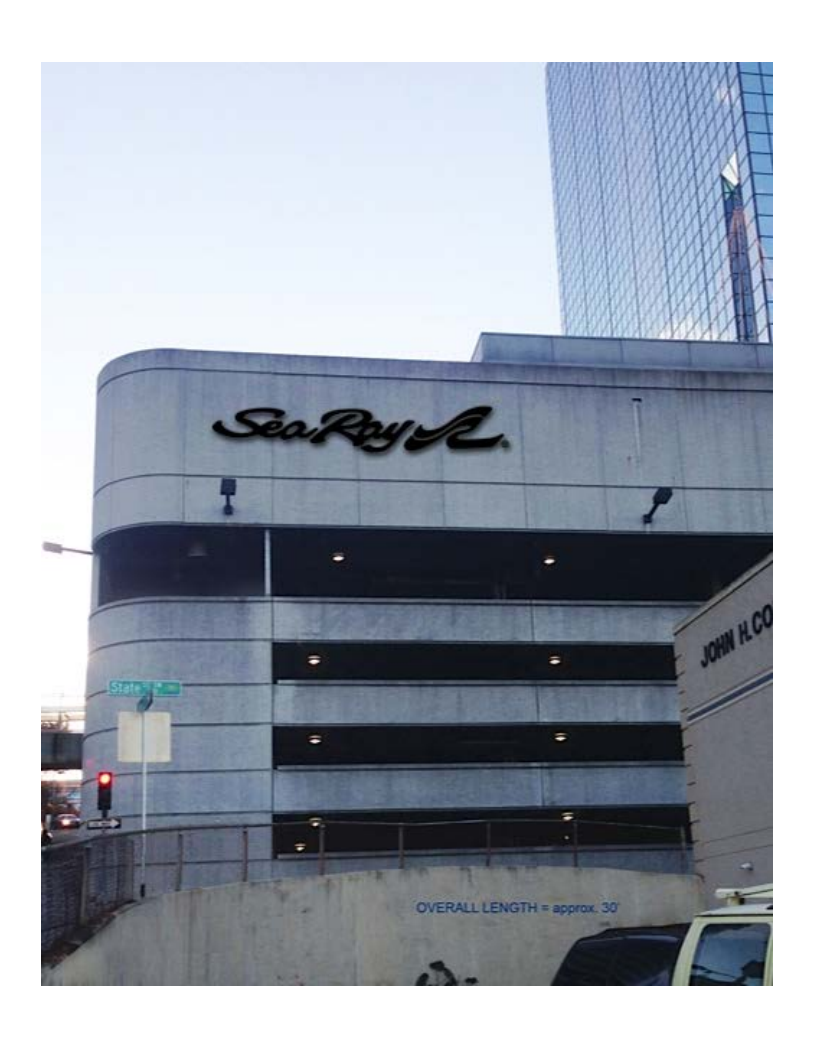
1<sup>st</sup> Tennessee Parking Garage State Street