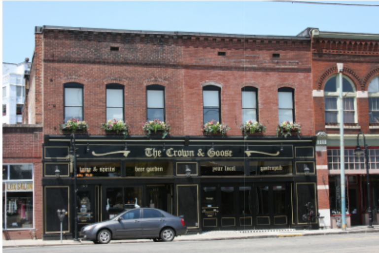
Facade To Be Matched