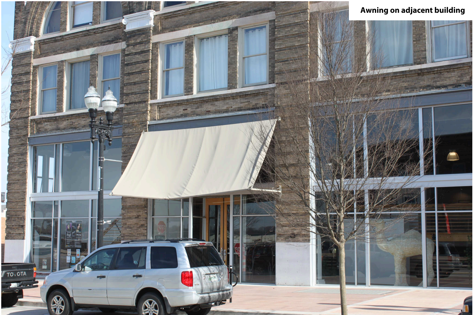
Awning on adjacent building