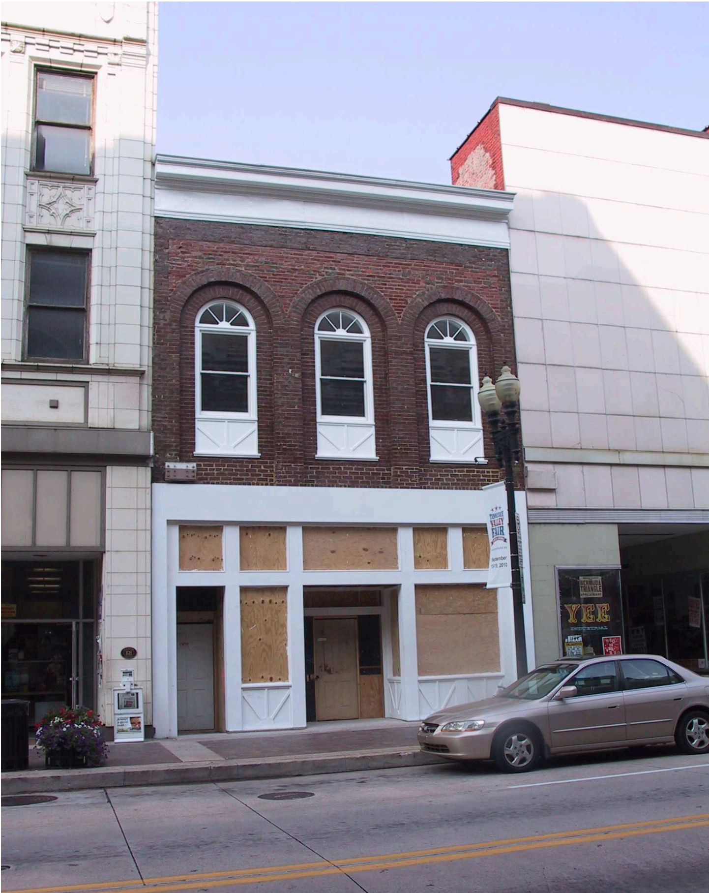
As of 8/10/2010