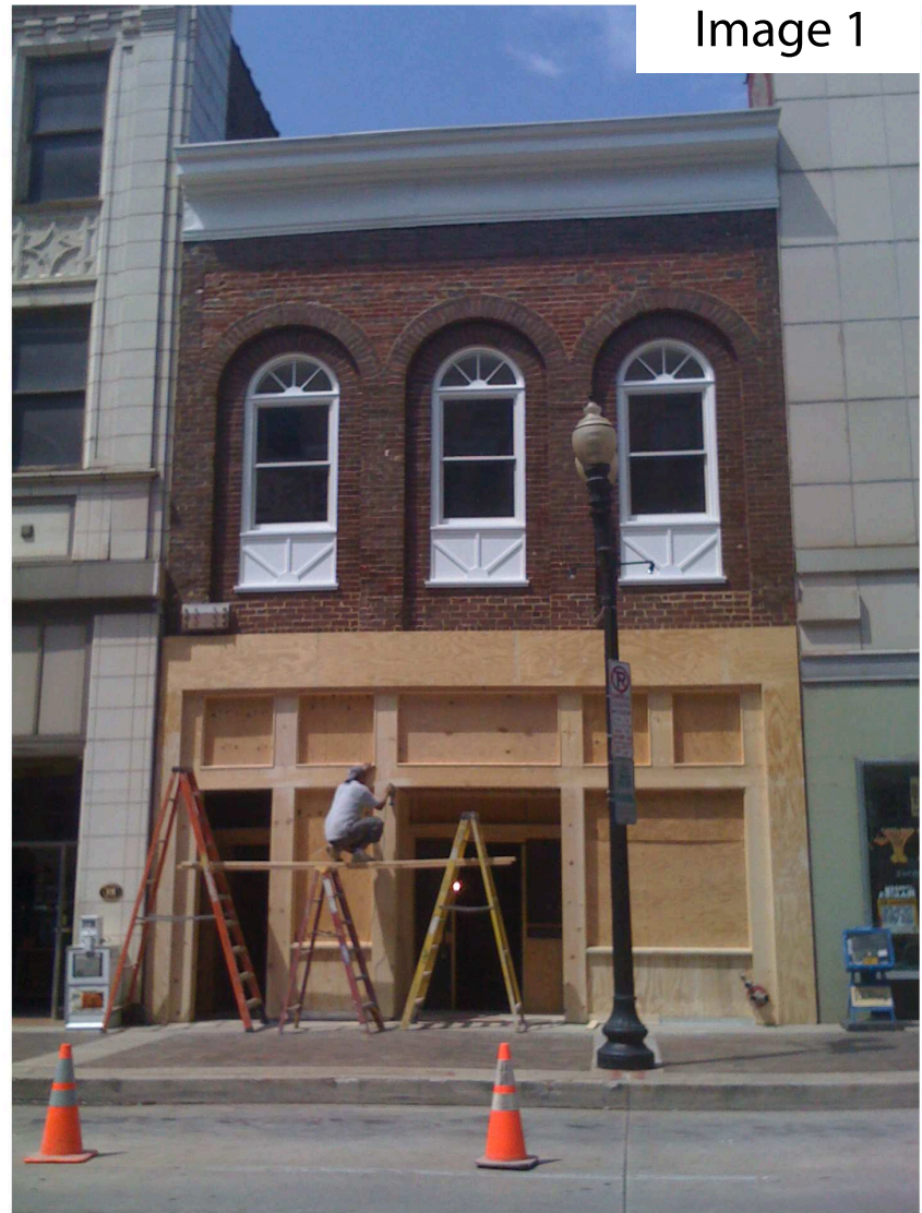
Renovation as of 7/27/2010