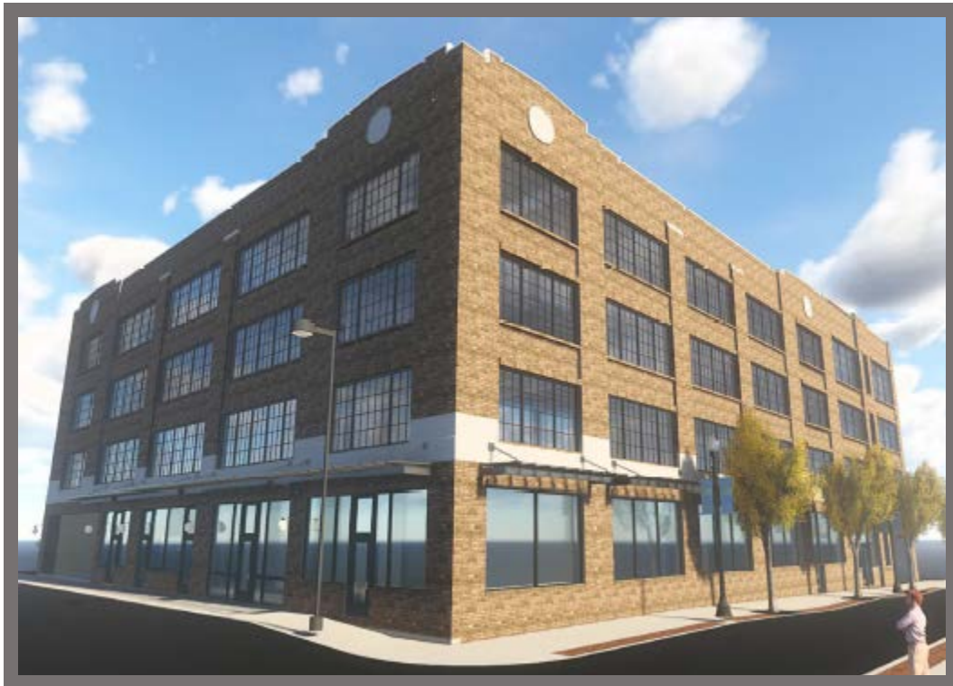
The Pryor-Brown parking garage viewed from the corner of Market St. and Church Ave.

The garage, constructed in two stages in 1925 and 1929, is believed to be one of the oldest parking decks in the country. It is eligible to be included within The Market Street National Register Historic District. The City Council had denied through the lack of a motion the owners’ use-on-review request for a surface parking lot on the site following the DDRB’s attempt to deny demolition in 2013. In 2015, the northwest corner of the roof of the garage collapsed causing damage to the brick façade.