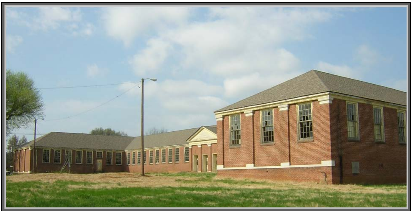
Proposals for re-use of South High as residential units were solicited by the City in 2016.