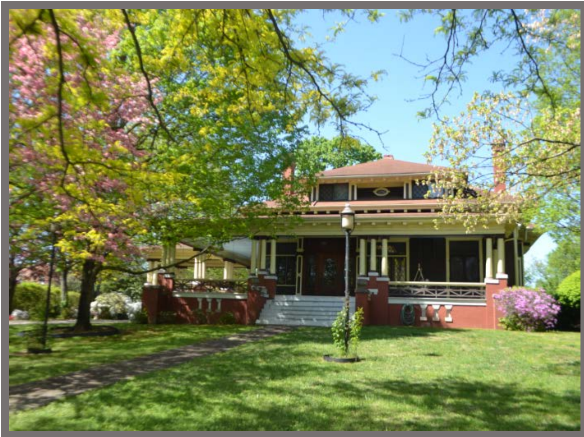
The Howard House as seen from the northeast approach of the circular driveway.

The Howard House, built in 1910, is an unusually elegant Craftsman house with Neo-classical elements and detailing. Currently the lot is zoned as office, which makes it vulnerable to re-development pressures. A historic zoning overlay (H-1) would protect this house from demolition.