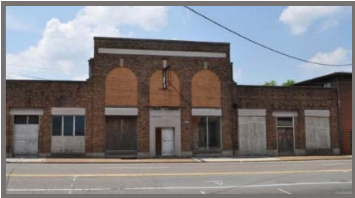
The Sanitary Laundry & Dry Cleaning Building was constructed in 1924.

In 2016, the city of Knoxville received a $350,000 grant from the Federal Environmental Protection Agency for clean-up the brownfields at this site as well as for that of the former McClung Warehouses. The city will contribute a 20 percent match, a combined $70,000 for the two sites. At the former laundry site, the contamination is related to the chemicals and solvents used in the dry-cleaning process. The 1925 building was listed as one of Knox Heritage's "Fragile 15" for 2015.