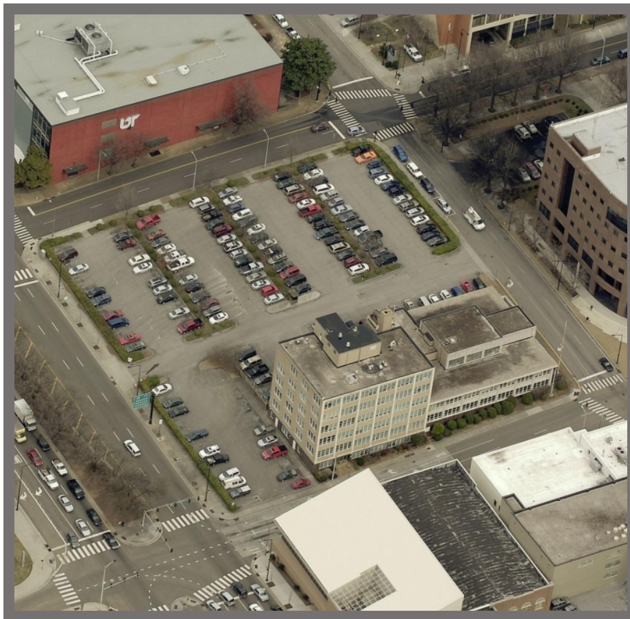
Bird's-eye view of Supreme Court Building

In November 2015, the City became the owners of the former Supreme Court Building and property. The City conducted a market study to determine the most appropriate uses and issued an RFP in early 2016 for redevelopment of the site while preserving the historic courthouse portion of the building. In October 2016, the City received four proposals for redevelopment of the site, and a purchase and sale agreement has been signed with Dover Development. The building, constructed in the 1950s, is a restrained example of the Art Deco style and has been vacant since 2003.