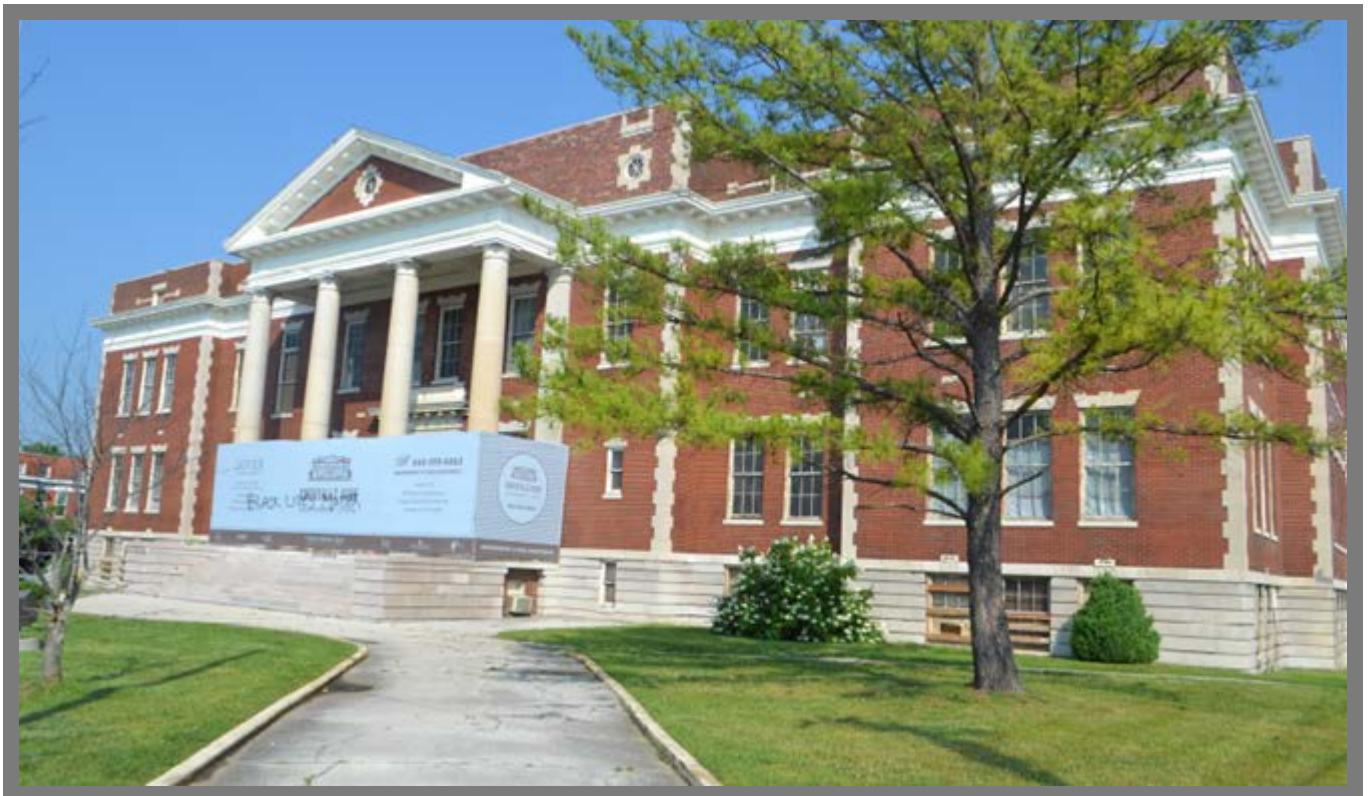
Historic Knoxville High School 2016 – pre-renovation

This former school building is protected with an H-1 Overlay, and in May 2016, the Historic Zoning Commission reviewed and approved window replacement which has recently begun. The renovation of this former school building is anticipated to be completed late this year. Following a request for proposals, the county-surplus building was sold in 2014 to Dover Development Group. The corporation plans to convert Old Knox High into a senior living facility offering 75 units. The building served as Knoxville High School from 1910 to 1951. It is listed on the National Register of Historic Places, making the project eligible to take advantage of the federal income tax credit for certified rehabilitation of historic buildings.