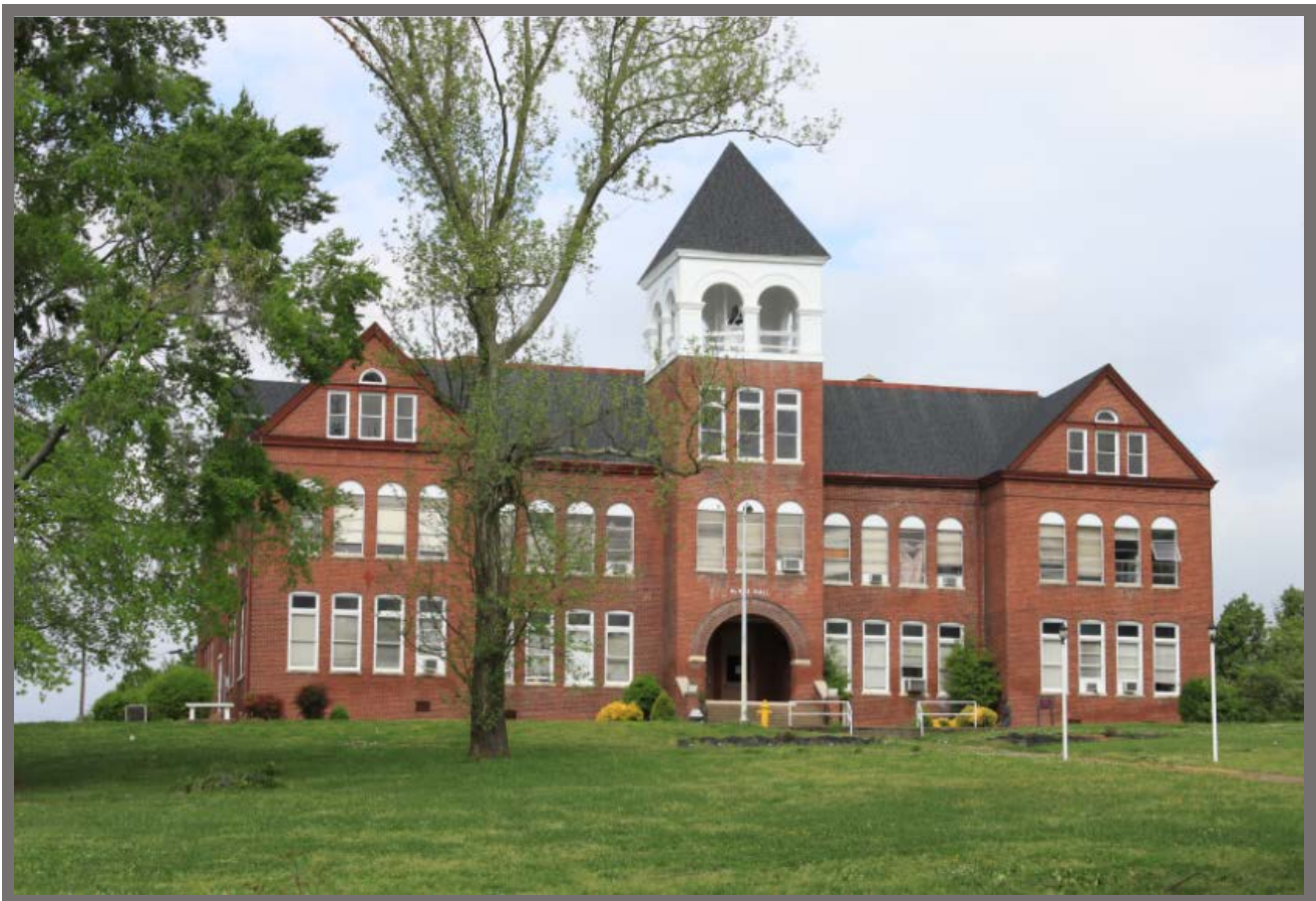
The roof and supporting wall on the rear of the 1876 McKee Hall Administration Building have collapsed.

Ten buildings on the Knoxville College campus comprise the National Register Historic District. The campus is historically significant beyond its architecture. It provides critical information pertaining to the attempted assimilation of freed men and women into post-Civil War America as an important part of Knoxville’s history as well as that of the state of Tennessee and the country.