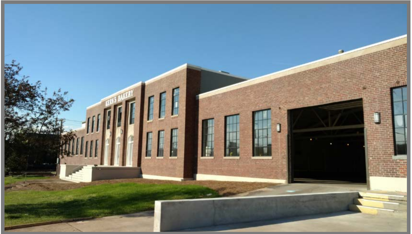
The former Kerns Bakery building front façade as seen from Chapman Highway.