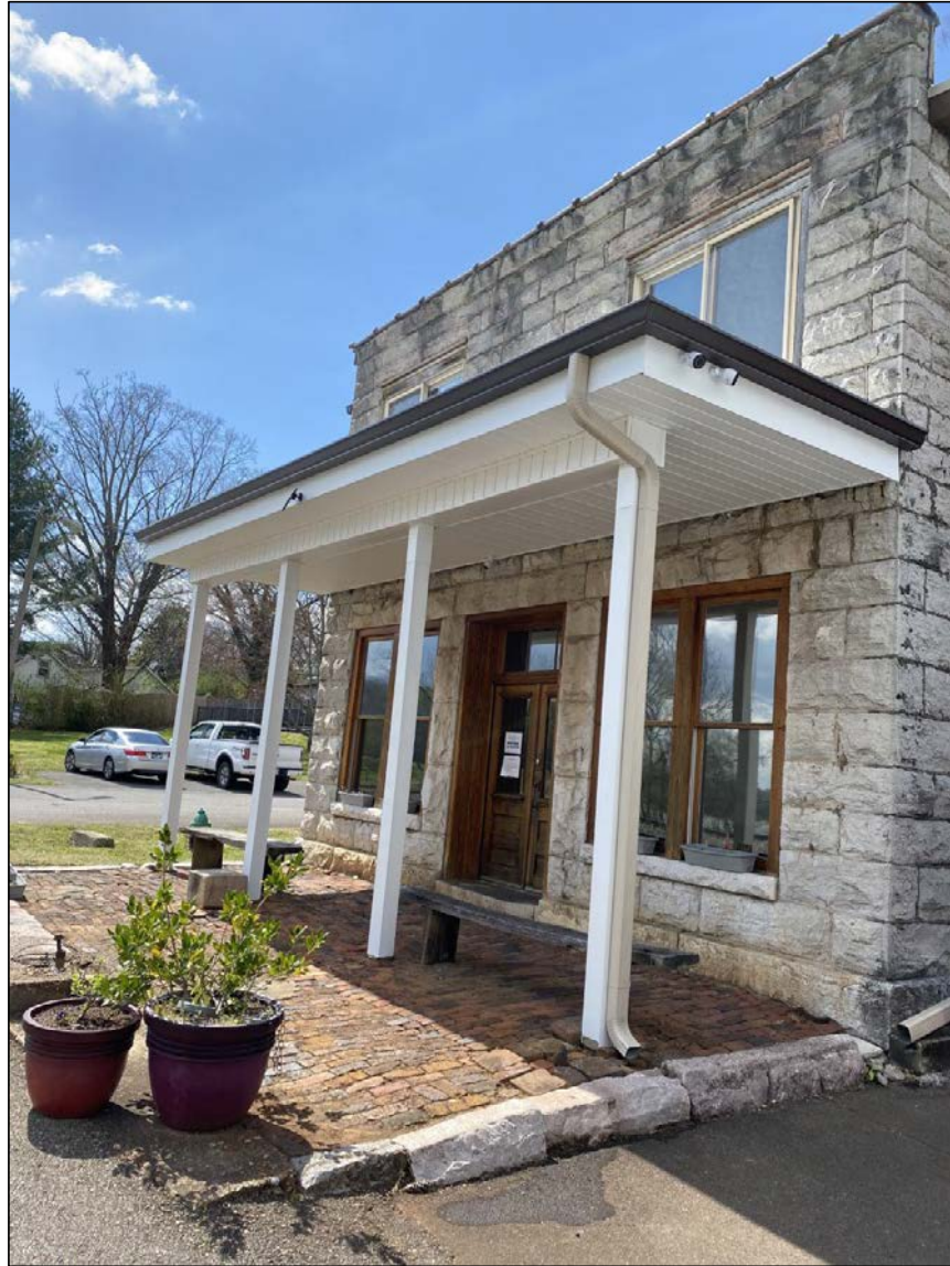
Photo of work completed, submitted by contractor