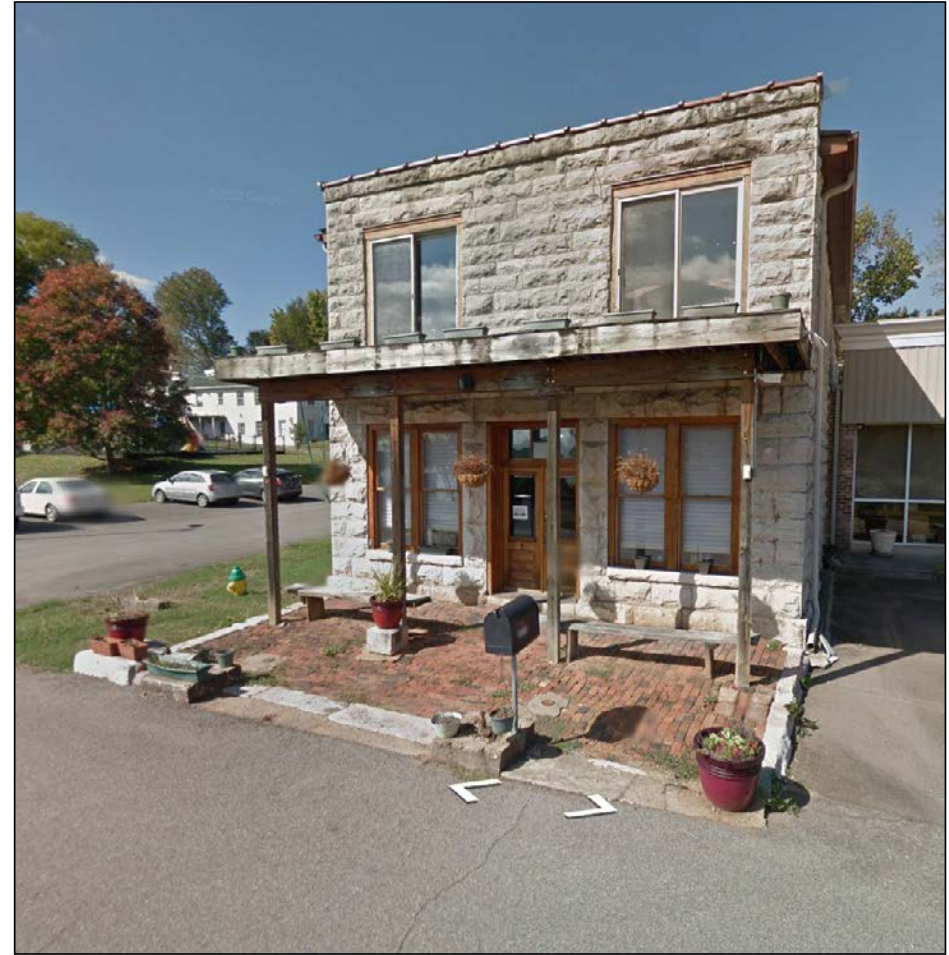
Google Streetview images of porch prior to work