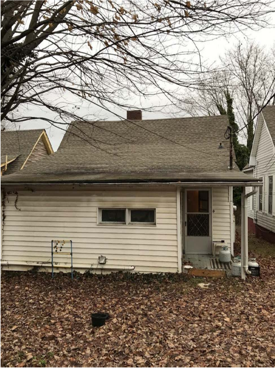
1616 Forest Rear: