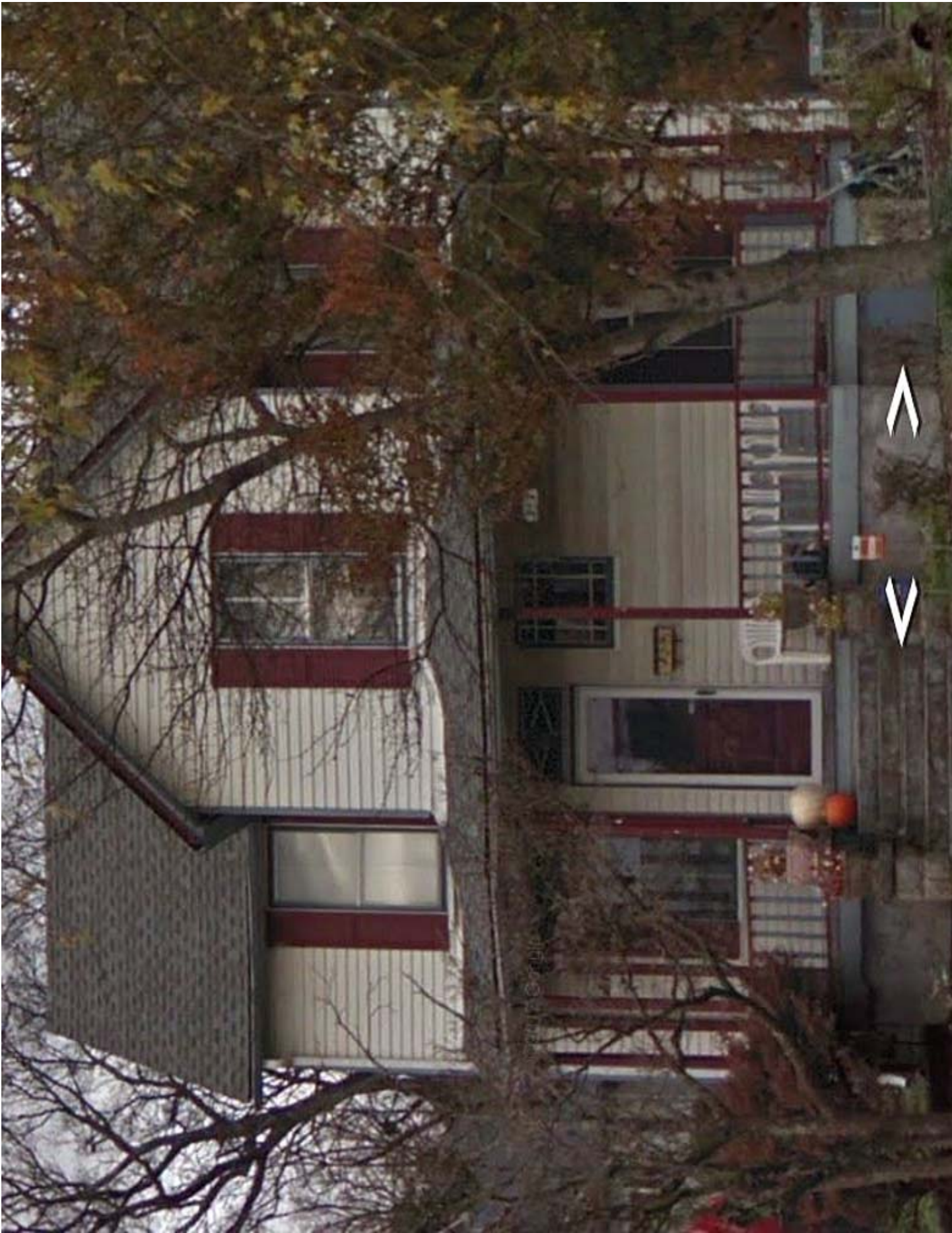
313 e. Oklahoma - Front facade