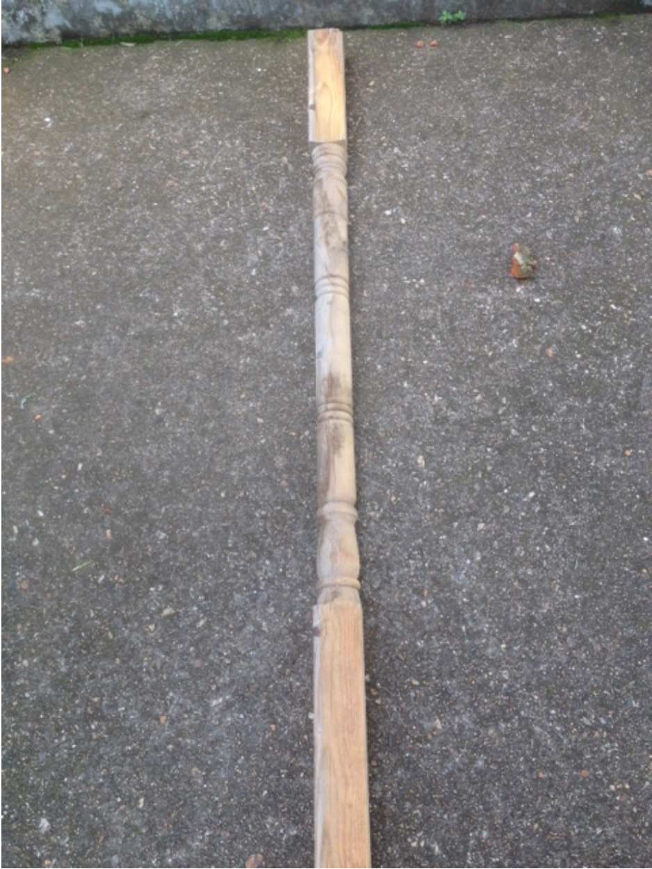
313 Oklahoma – Proposed porch support