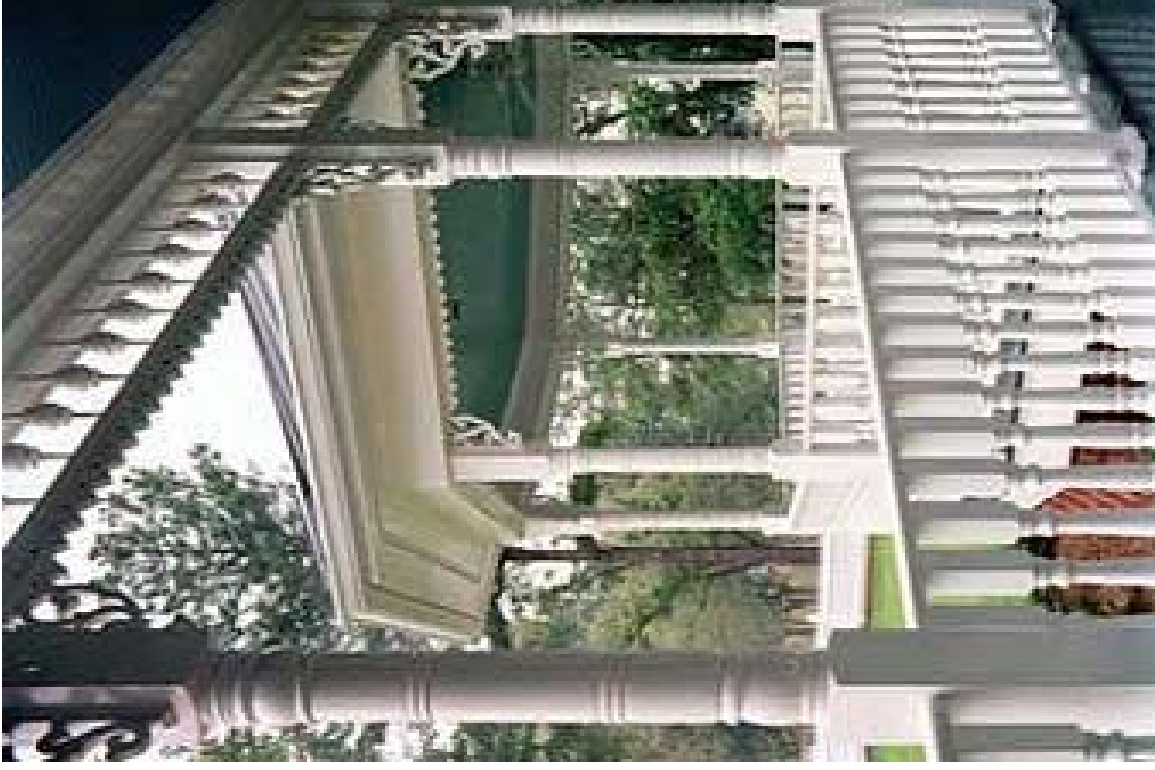
313 Oklahoma - Proposed porch supports and balustrade