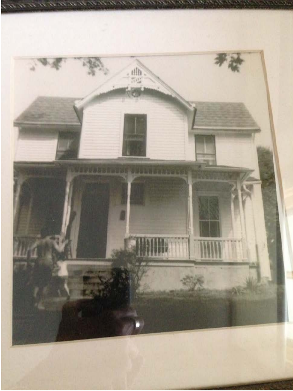
313 Oklahoma – Front façade in early documentary photo