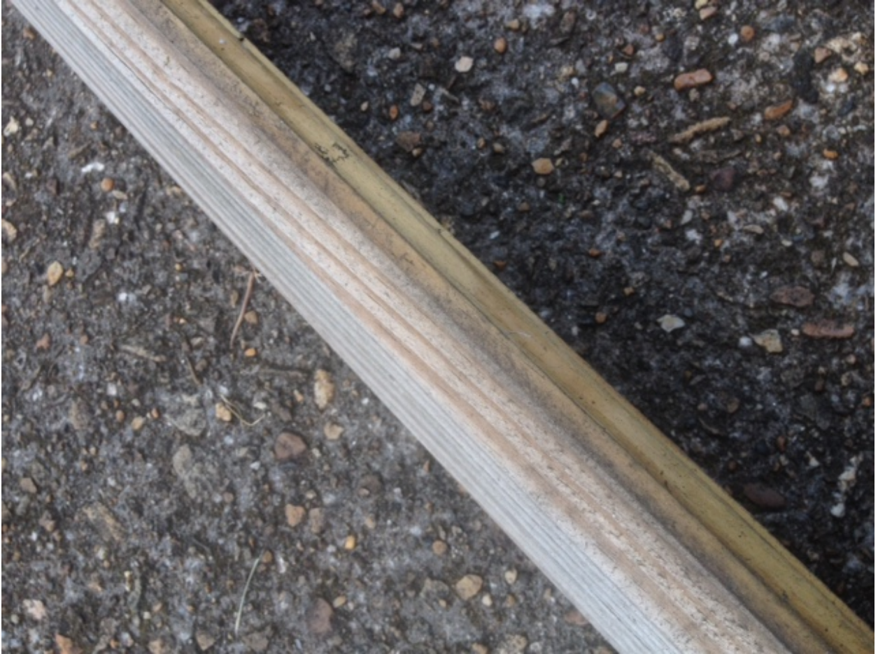
313 Oklahoma – Beveled top rail