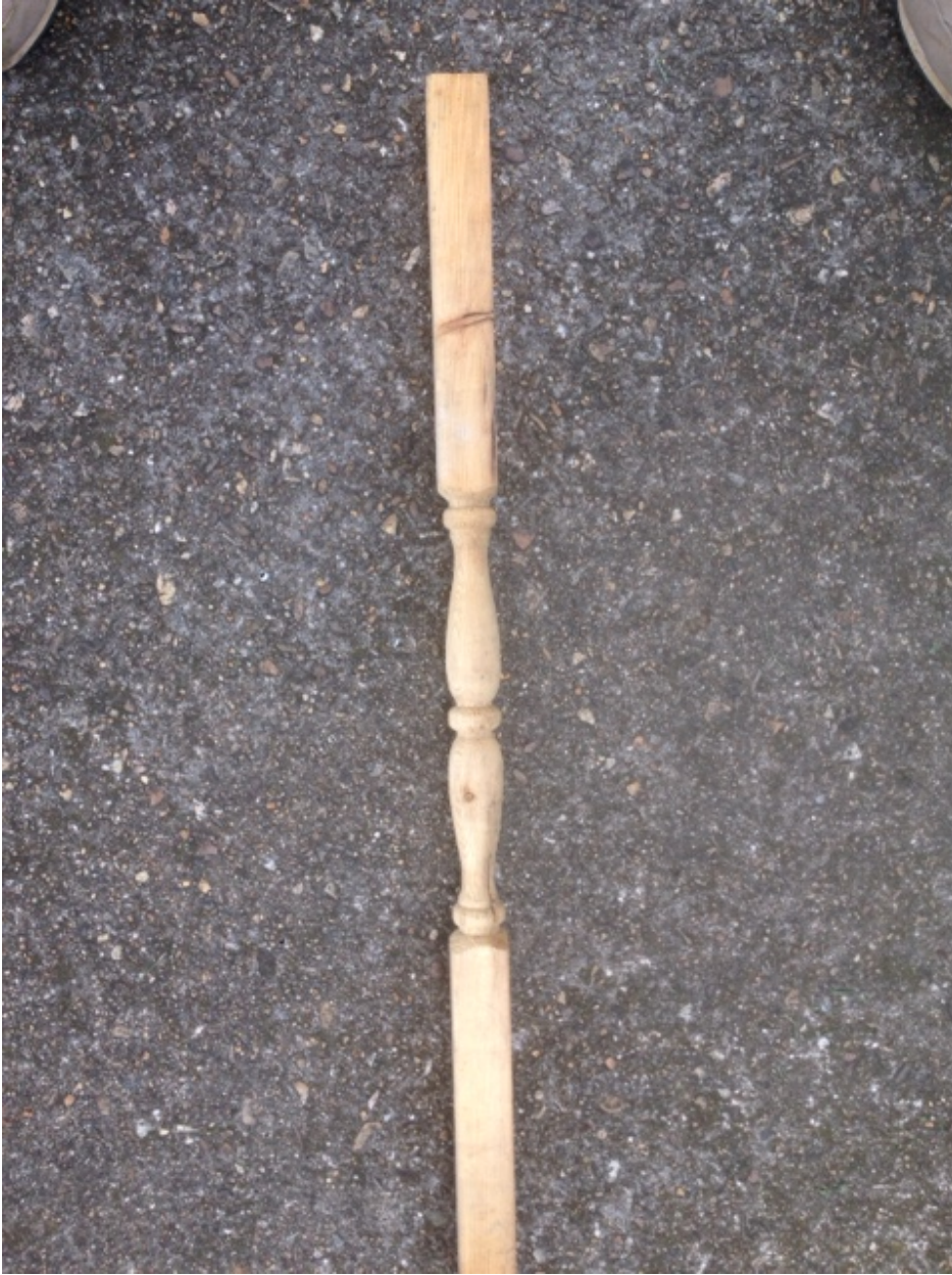
313 Oklahoma – Proposed baluster