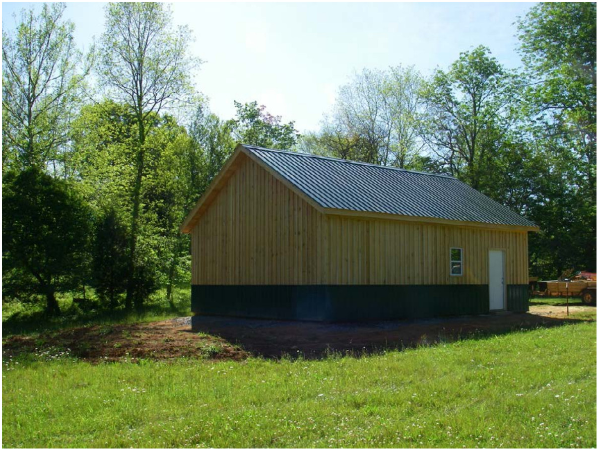
General Reference Photos