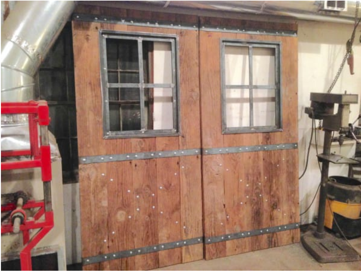
Proposed Door Design