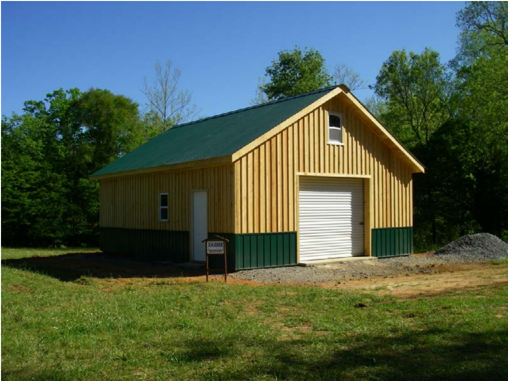
General Reference Photos