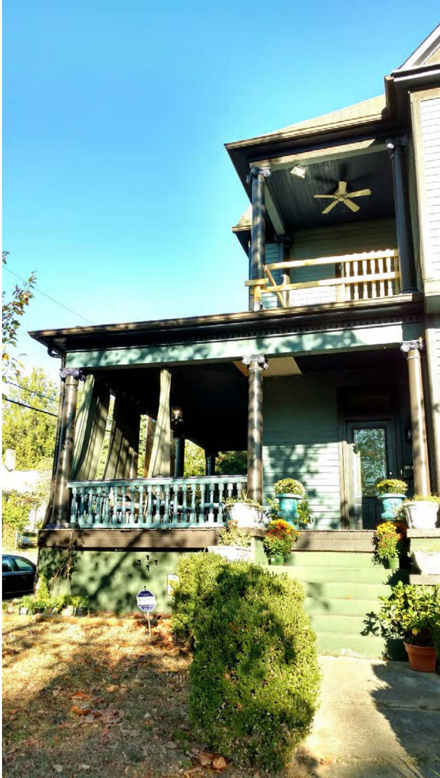
303 E. Oklahoma - Mock-up of balcony balustrade viewed from street