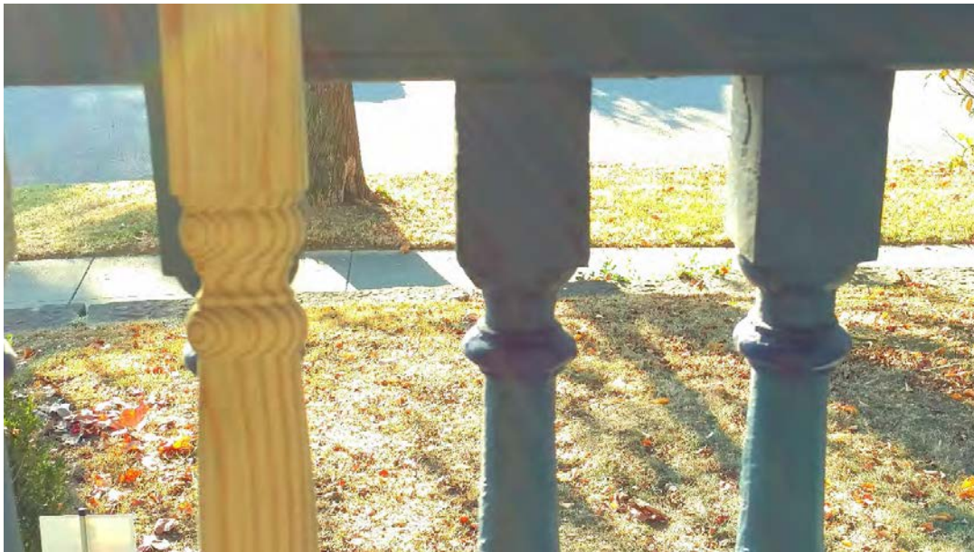
303 E. Oklahoma Avenue – proposed balcony baluster next to existing first-level porch baluster