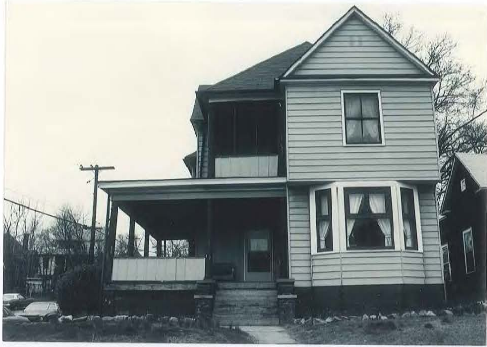
303 E. OKLAHOMA AVE - 1992