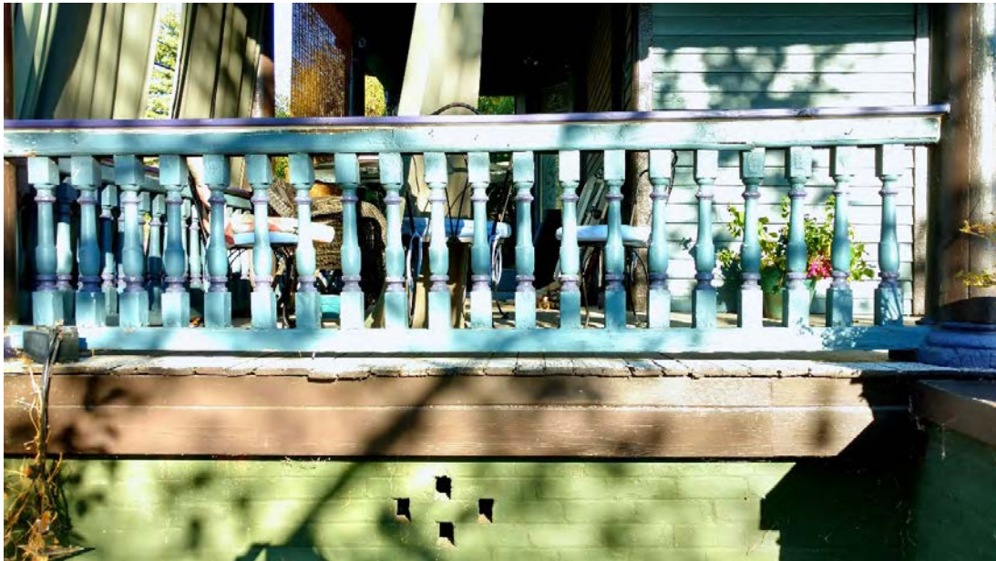
303 E. Oklahoma – Existing first-level porch balustrade