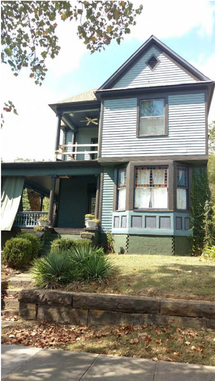
303 E. Oklahoma – Front façade showing upper balcony with no balustrade