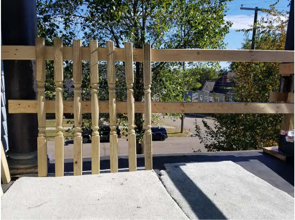
303 E. Oklahoma - Mock-up of balcony balustrade viewed from inside the balcony