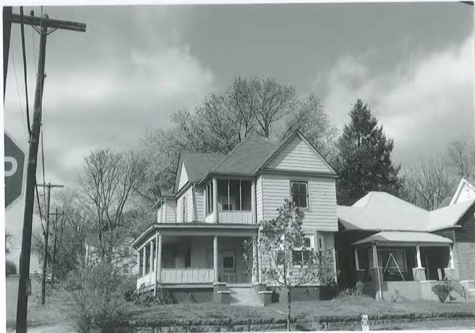
303 E. OKLAHOMA AVE. 1996