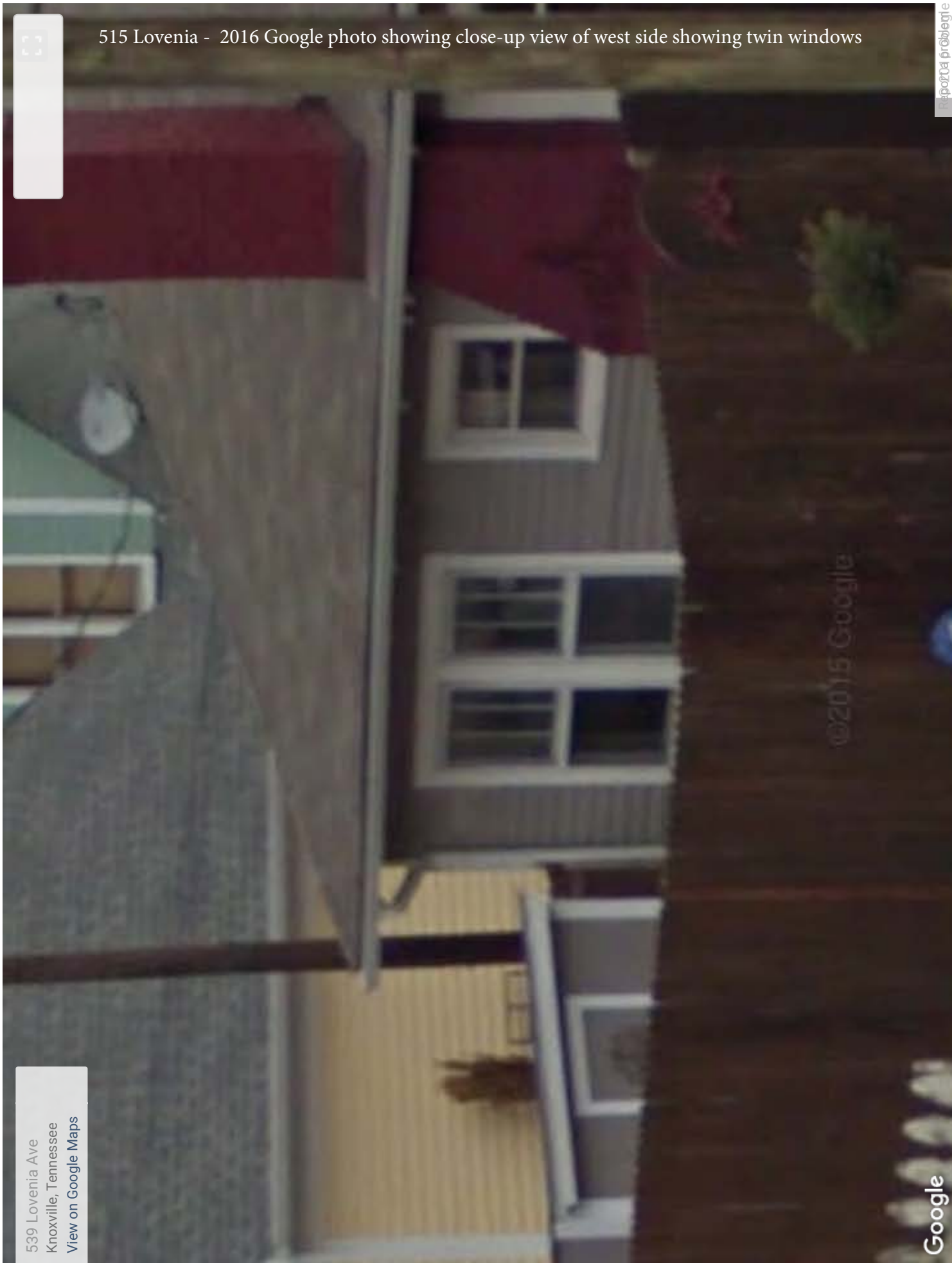
515 Lovenia - 2016 Google photo showing close-up view of west side showing twin windows

539 Lovenia Ave Knoxville, Tennessee View on Google Maps