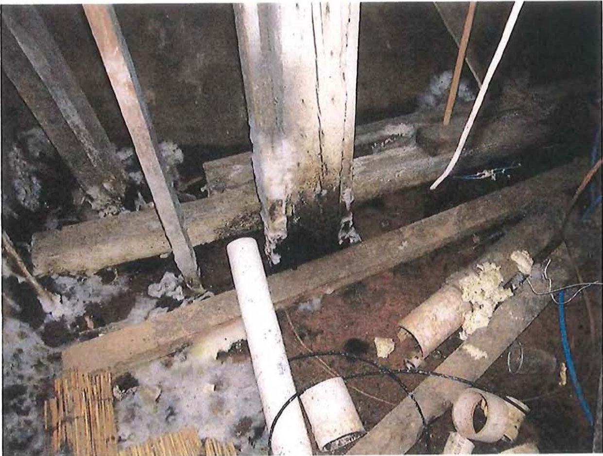
Typical post used to support the main level floor framing.