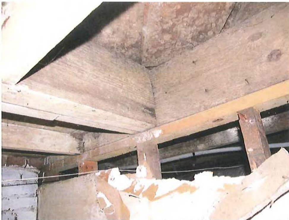
Triple beam framing into girder that supports the front brick façade. Wall not adequate to support load.