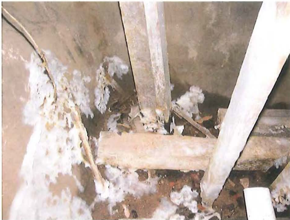
Posts and studs used to support the main level floor framing.