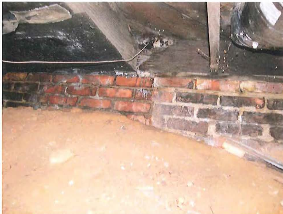
Rim joist is wet, indicating water penetration from outside. Joists connection is being lost.