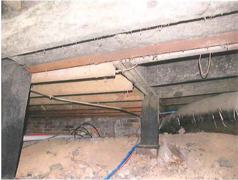
New joists replaced original joists. New joists connection failed.